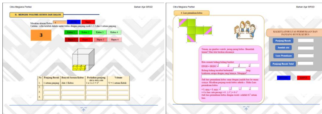
Figure 5. Concept discovery content samples

Figure 5 is a sample of teaching material content based on VBA Microsoft Word where there are conceptual findings on the volume and surface area of the cube. In addition, teaching materials contains material from recognizing prisms and pyramids, making characteristics and definitions of prisms and pyramids, distinguishing the sizes of cubes and blocks, proving the volume of cubes and blocks, comparing the volume of prisms and pyramids, finding the formula for the surface area of prisms and pyramids, until as in Figure 6, it is an evaluation tool that contains MPSA questions with different level of pain indexes.