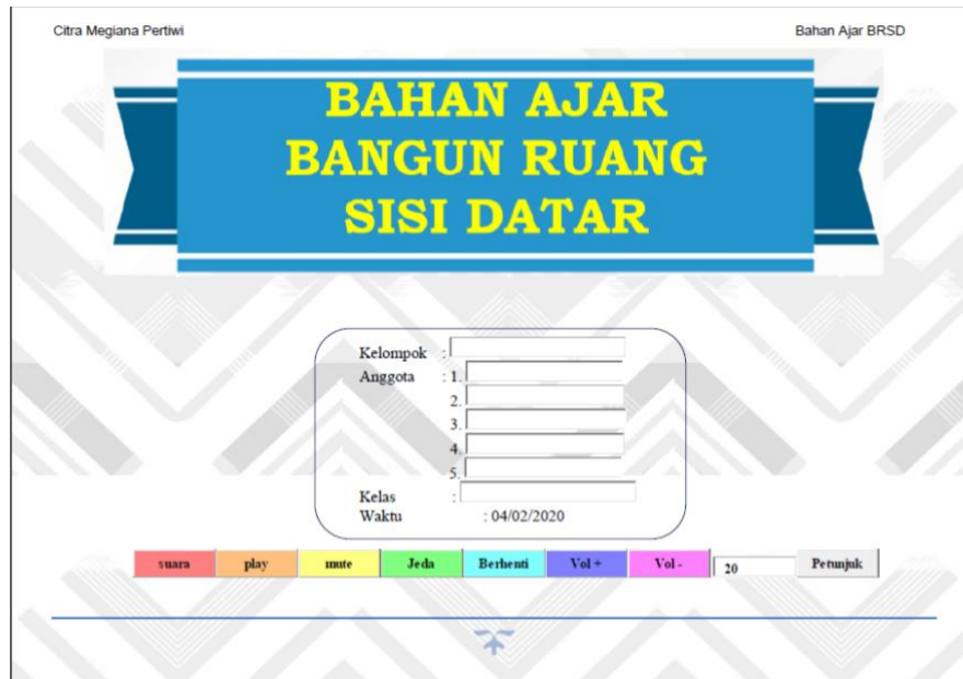
Figure 4. Display a cover of teaching material

Figure 5 is a sample of teaching material content based on VBA Microsoft Word where there are conceptual findings on the volume and surface area of the cube. In addition, teaching materials contains material from recognizing prisms and pyramids, making characteristics and definitions of prisms and pyramids, distinguishing the sizes of cubes and blocks, proving the volume of cubes and blocks, comparing the volume of prisms and pyramids, finding the formula for the surface area of prisms and pyramids, until as in Figure 6, it is an evaluation tool that contains MPSA questions with different level of pain indexes.