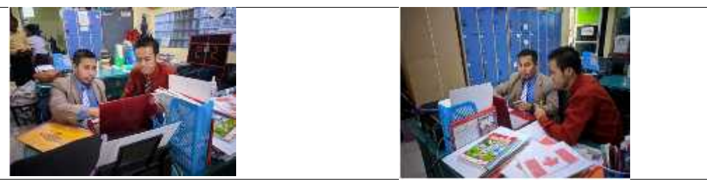
Figure 6. Reflection Process Cycle II

of education and the advancement of education, especially in English Language Study Program IKIP Siliwangi.