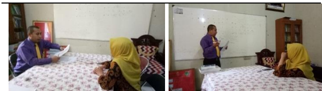
Figure 2. Cycle Planning Process I

Learning scenarios are adjusted to the objectives, material and level of development of students, sought variations in the delivery. The composition and steps of learning have been adjusted to the objectives, material, level of development of students, the time available, systematically is to place students in a central position, to follow changes in educational strategies from teaching to learning according to Ministry of Education Decree No. 41 of 2007 and adjusts to the Fishbowl learning model.