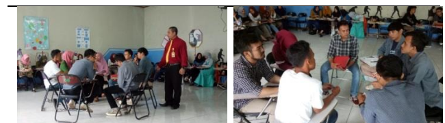
Figure 3. Cycle I Implementation Process