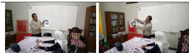
Figure 4. Cycle I Reflection Process and Plan for Cycle II

the success of Fishbowl learning conducted by lecturers / researchers.