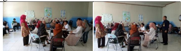
Figure 5. Cycle II Implementation Process

The third step, students are given time to give their reasons without using notes and are required to use full English. And the fourth step, students are given several questions given in the middle of their discussion.